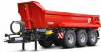
MUP 30HP (31-34 t total weight)