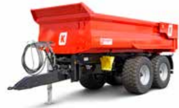
MUP 20SP (20-24 t total weight)