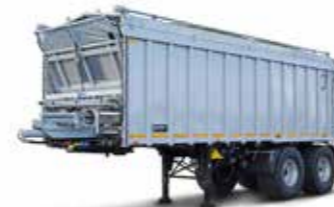
SAW 32 (32 t total weight)