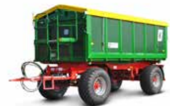
HKD 302-S (18 t total weight)