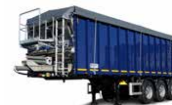
SAW 36 (36 t total weight)