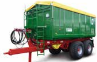
TKD 302-S (20-24 t total weight)