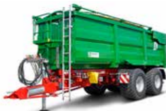
MUK 303 (20-24 t total weight)