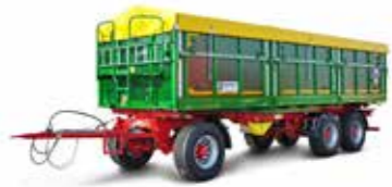
HKD 402 (24 t total weight)