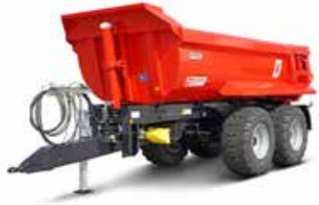
MUP 20HP (20-24 t total weight)