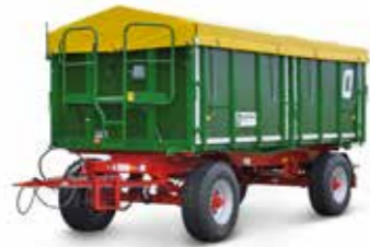
HKD 302 (18 t total weight)