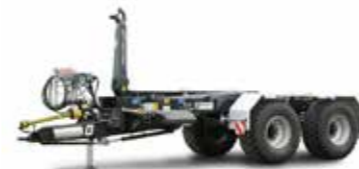
THL 20 (20-24 t total weight)