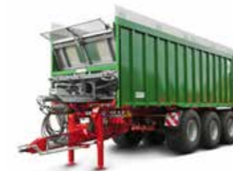
TAW 30 (31-34 t total weight)