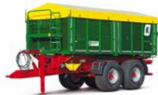
TKD 302 (20-24 t total weight)