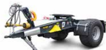
EAD 14 (14 t total weight)