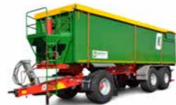
TMR 34 (34 t total weight)