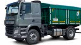
ZKA 1 (16 t total weight)