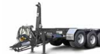
THL 30 (31-34 t total weight)