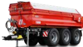
MUP 30SP (31-34 t total weight)