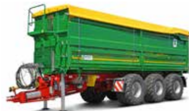
MUK 402 (31-34 t total weight)