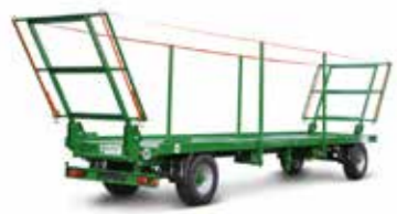
PWO 18 (18 t total weight)