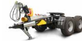
TAD 22 (22 t total weight)