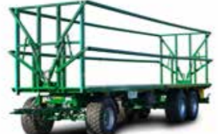
PWO 24 (24 t total weight)